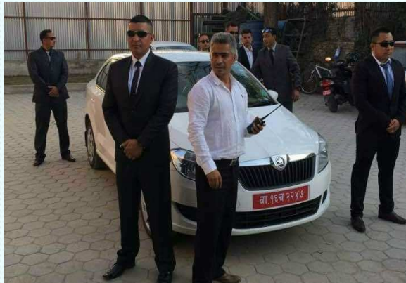
Gurkha VIP personal detail