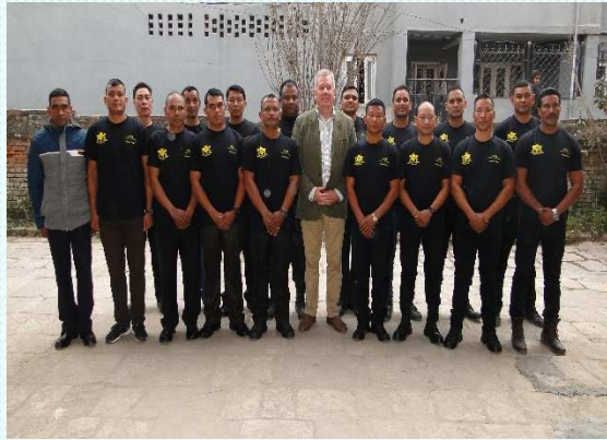
Duty assignment roster call