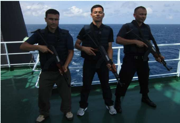
Our Gurkha MSO at high seas