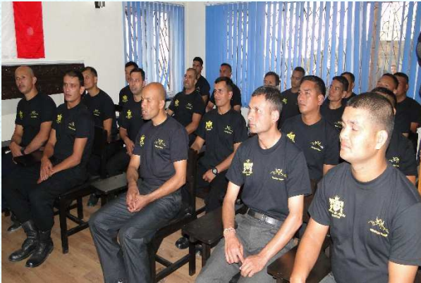
Gurkhas orientation class